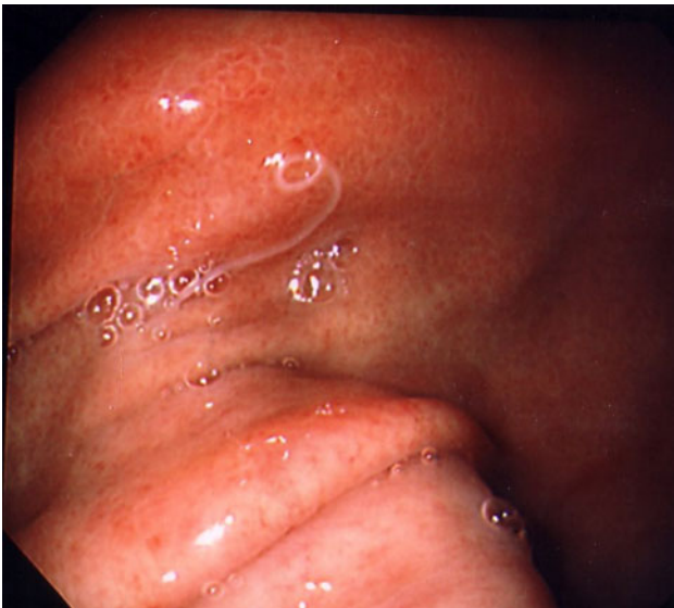
Fig. 1 Upper endoscopy showed the presence of an A. simplex larva in the anterior wall of the gastric body

the stomach (Fig. 2a, b). Histopathologic examination was not performed. The abdominal discomfort subsided within several hours and skin manifestation disappeared within 4 days after endoscopic removal of the worm. The results of allergy evaluation were as follows: total serum IgE was elevated (670 IU/mL) and specific IgE antibody to A. simplex was positive (26.2 IU/mL) by fluoroenzyme immunoassay (Pharmacia, Uppsala, Sweden), while specific IgE to mackerel was negative (<0.35 IU/mL). Given the clinical and laboratory findings, the patient was diagnosed as Anisakis -induced hypersensitivity and not mackerel-induced hypersensitivity. She has had no further acute allergic symptoms since she began to avoid raw seafood.